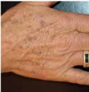
Pigmented lesions | before

The high power, optimized by the homogeneous spot, makes it possible to remove benign pigmented lesions quickly and effectively, without damaging the surrounding tissue. The pulses are absorbed selectively by the melanin pigments in the skin. These are pulverized by the laser energy and eliminated naturally by the lymphatic system or via the epidermis.