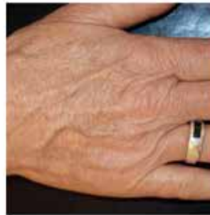
Pigmented lesions | after