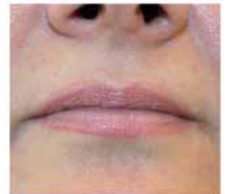
Permanent make-up | after