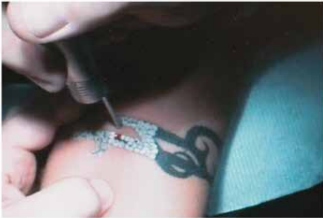
Laser's popcorn effect on the skin

Today there is an increasing demand for tattoo removal. On average, one person in two wants to remove his tattoos after about ten years. This derives from the inevitable changes in fashion and styles or simply from aging.