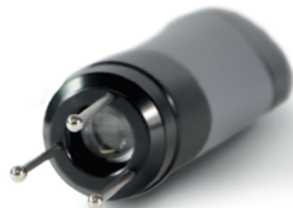
MicroSpot FRx Handpiece