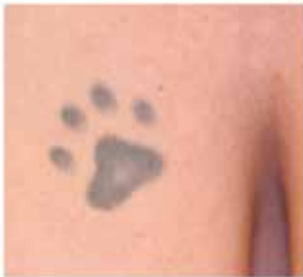
Tattoo removal | before

Technically, the removal of permanent make-up is very similar to the removal of tattoos, which means that TattooStar is the ideal solution for this type of operation: quick, precise, effective treatment with minimal side effects.