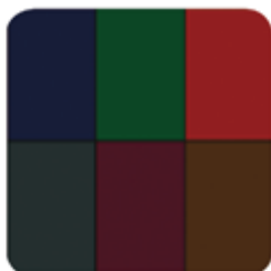
Color range erasable with laser

TattooStar emits Q-switched pulses - high power pulses lasting nano-seconds - which are absorbed by the pigments present in tattoos and stains in the skin. With the flexibility of up to four wavelengths, the physician is able to adapt the treatment exactly to the patients' needs and to the different range of pigment colors.