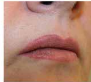
Permanent make-up | before