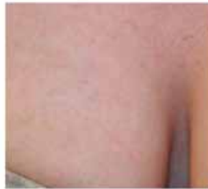
Tattoo removal | after